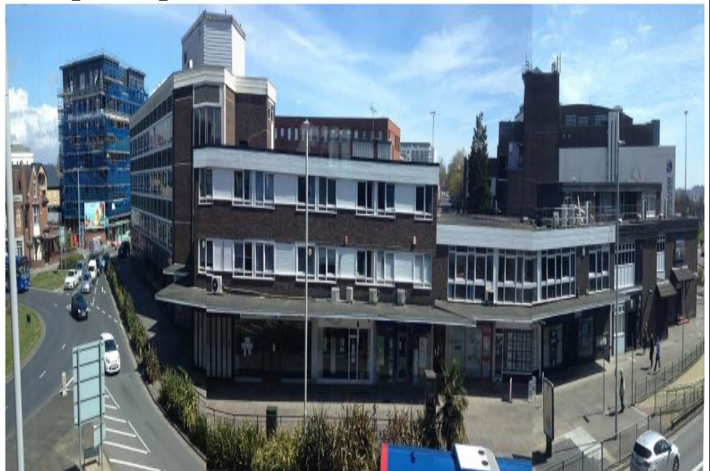
FIG 1.5 Panorama View of the existing building facade and context